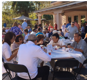
Family and friends enjoying a lovely meal