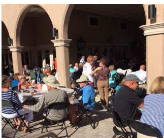
Neighbors and tennis players enjoying the day