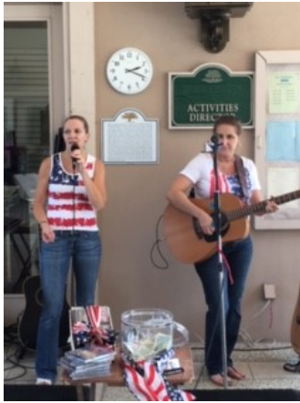
Gailforce entertaining the crowd

The crowd that gathered had good food, fun, sing along and some very patriotic outfits