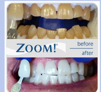
Actual patient results!

are excited to announce that the #1 patient-requested professional whitening system is now available at Florida Family Dentistry!