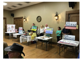
Candidates available to speak to residents