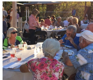
Enjoying a beautiful day and some flashback music