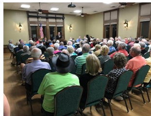
Audience listening to the candidates