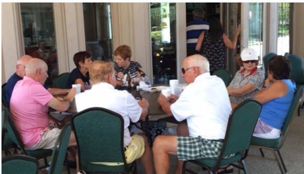
One of the many tables enjoying the company of friends and neighbors