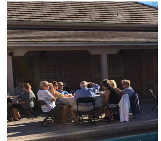
Friends enjoying each other's company