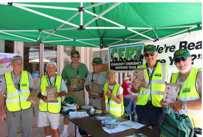
Members of the Grand Haven Cert Team

Make-up sessions are available for volunteers who were not able to attend this or subsequent sessions. Grand Haven residents are encouraged to attend any sessions that fit their schedules.