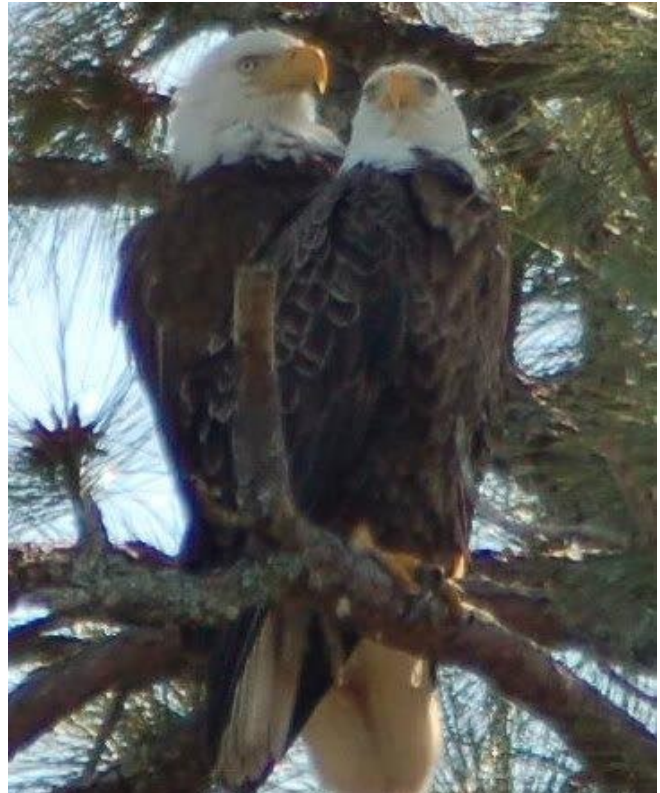
Mr. & Mrs. WO Eagle

Florida eagle nesting season officially begins October 1. Since the pair returned, it has been seen in the nest, around the nest area and across the Intracoastal Waterway. The eagles are chatting a bit and adding to their nest; things will get serious in the weeks to come with bonding and mating. Incubation should begin around Thanksgiving and hatching should take place by the first of January.