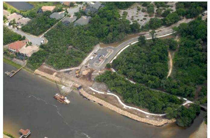
Park under construction, GH homes visible on left.

Waterfront Park will be a passive park with activity areas for picnicking, a playground, fishing pier with shaded area, and walking trails.