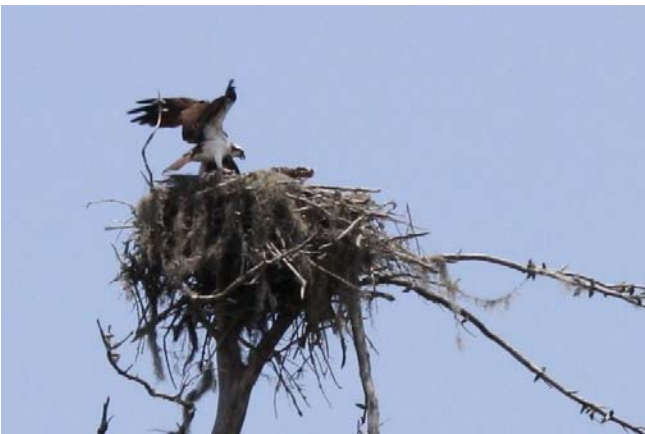
Osprey nest all naturel