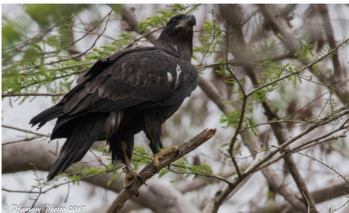
Peace release with tags

Life in the wild is tough, but Romeo and Juliet can again boast of 100% successful fledges for the ninth consecutive season. Their "home" is where it all happens . . . .