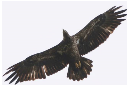
Hope soaring release day 3.14.17

The Long Leaf Pine is smiling" Its heart beats with a nest. Romeo & Juliet chose this beauty, And they faithfully fulfilled their quest. To raise an eaglet family Both fierce and gentle too, We are blessed to share their life Thanking nature for the view. So let's rejoice in their success And embrace this special time, While our eagles fly strong and free, "We smile with the Long Leaf Pine".