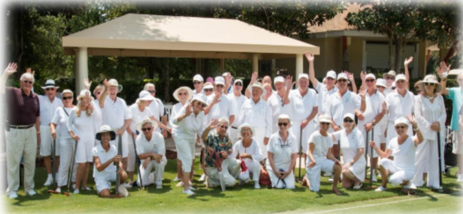
Croquet Club members celebrate opening

After some unexpected delays, it appears that our newly refurbished court is open and ready for play. Needless to say, the Croquet Club members are excited about returning to Creekside and looking forward to the new playing surface. Many plans are underway in anticipation of the return.